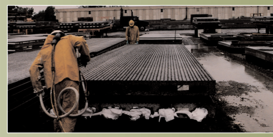
Hollow-core, pre-stressed concrete panels

Core-Fill 500™ was installed into 350,000 square feet of masonry in the Washington Redskins Stadium.